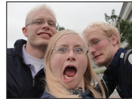
^ Brothers Parents >

Best of all, my family was able to see my life here. Instead of going home to my family, my family came to me!