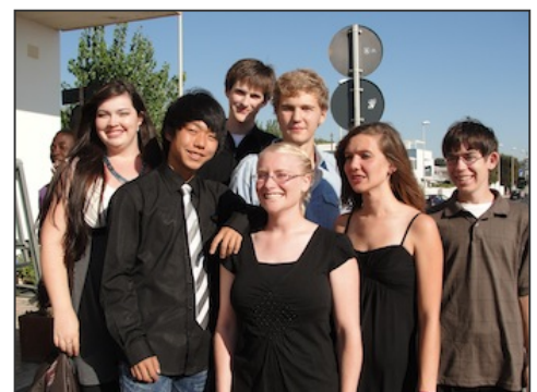
^^ (Top) I had many great discussions with this student